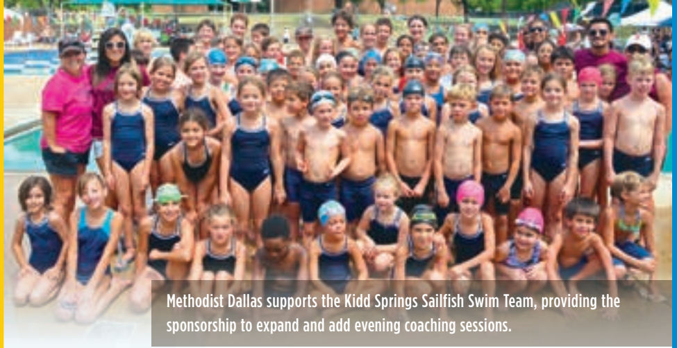
Methodist Dallas supports the Kidd Springs Sailfish Swim Team, providing the sponsorship to expand and add evening coaching sessions.