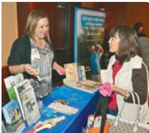
Women attending MeTime got to learn about Methodist Dallas programs, such as the Joint Academy, which helps patients prepare for joint replacement surgery and recover faster.