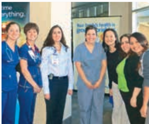
Members of the Methodist Dallas stroke care team and the staff at Methodist Family Health Center – Preston Hollow team up to provide important health information to the employees at The Dallas Morning News .